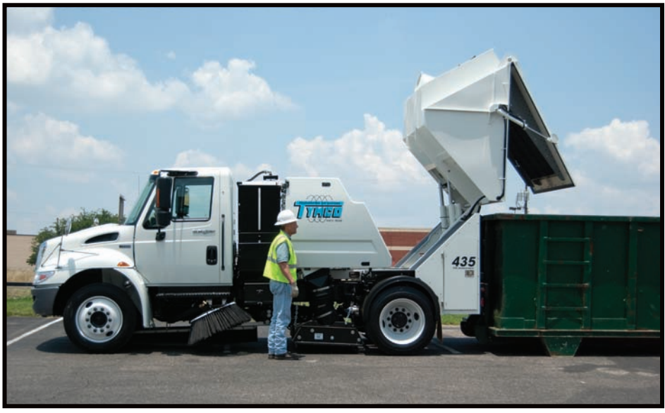
With the Conventional Truck Package, the Model 435 has a 81 inch dump height. (Most 30 yard containers are approximately 69 inches)