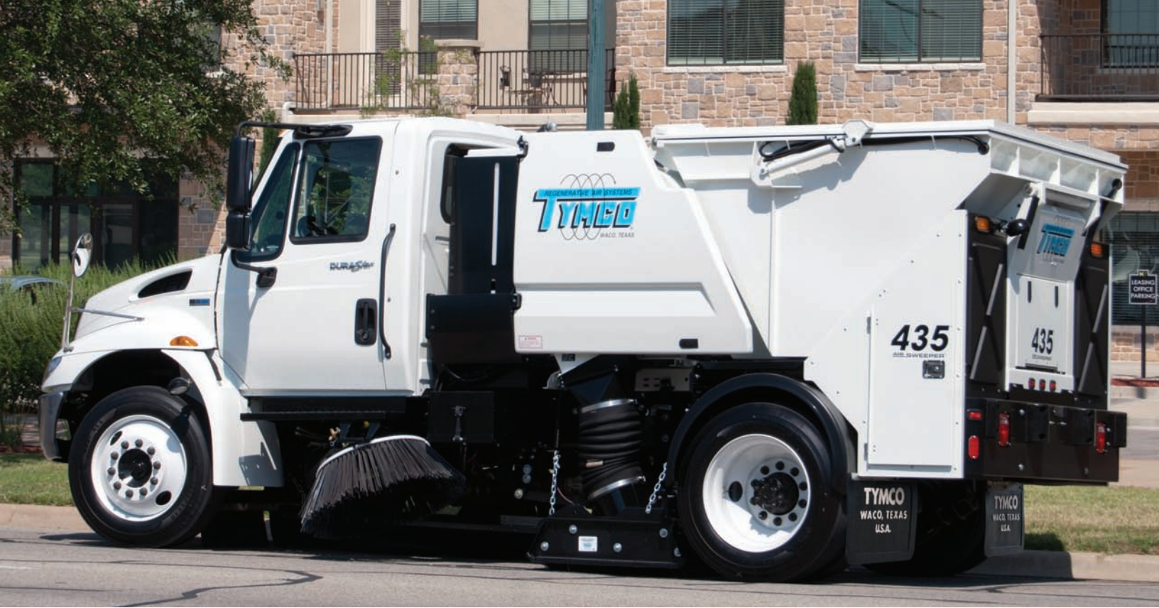
The Model 435 delivers street sweeping performance in a mid-sized package. With the Conventional Truck Package, the Model 435 has a payload of over 8000 lbs. and overall sweeping path of 132 inches.